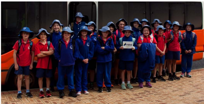
Lake King students arriving for the workshop

Thank you to Foundation for Rural & Regional Renewal, (FRRR) who sponsored the bus trips for some of our surrounding towns.