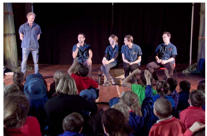
Above : The team spent time with a Q & A session after the show.